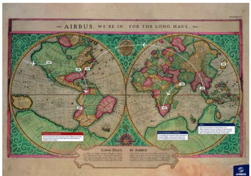
Airlines and aircraft makers tout their long-range capabilities: good for travelers, but also good for spreading disease globally.

level of public health and a high level of poverty. Governments must contend with these two problems in their efforts to stop infectious disease.