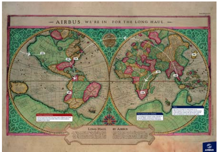
Airlines and aircraft makers tout their long-range capabilities: good for travelers, but also good for spreading disease globally.

level of public health and a high level of poverty. Governments must contend with these two problems in their efforts to stop infectious disease.